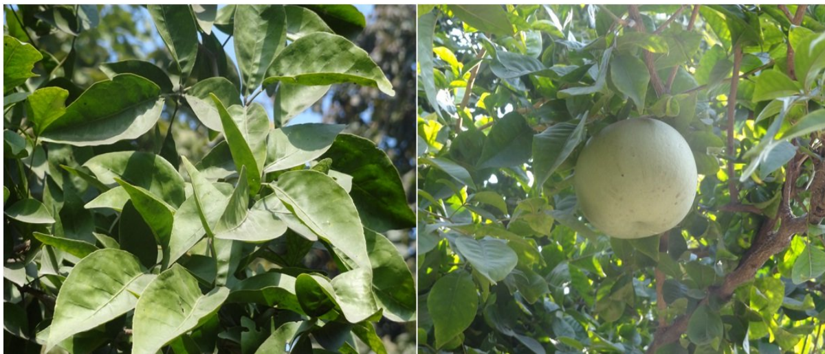
Fig. 2: Leaves and fruit of Aegle marmelos