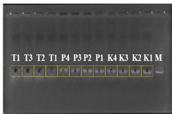
Figure 3. Semi-Quantitative Analysis Using the Image J Application

The results of electrophoresis in the form of electrophoregram were then analyzed using the Image J application ( Figure 3 ), where each band will produce AUC (Area Under Curve) based on the thickness of the tape. The thicker the band, the higher the AUC will be. High AUC correlates with the level of secondary metabolites of plants tested, in this case, the level of asiaticoside from the UGT73AH1 Centella asiatica L. gene. The semi-quantitative analysis of AUC can be seen in Table 2 .