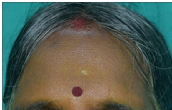
Figure 1. Traditional application of Turmeric as a cosmetic (facial powder) in India.

The traditional application of Turmeric as a cosmetic (facial powder) in India is presented in Figure 1 .