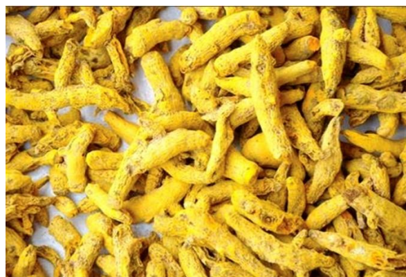
Figure 3. Rhizomes of Turmeric