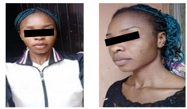
Figure 8. Picture after 7 days of cream application

The use and application of turmeric as medicine has been mentioned across the globe [22, 23]. Turmeric has gained popularity in herbal medicine. This study examines turmeric in the aspect of cosmetics and skin care. From Figure 4 in this study, the face after Obeturmeric powder gave additional beauty to the face of the subject. This study suggests the beautifying nature of turmeric in cosmetology. This tends to agree with Roy [24] who opined that Turmeric beautified skin in India. Figure 5 showed a unique beauty when compared with the face before the makeup with an Obeturmeric powder mixture. This shows that a combination of Turmeric and Beetroot has an additional unique beauty on a subject. No wonder Vaughn et al. [25] agreed that curcumin mixture