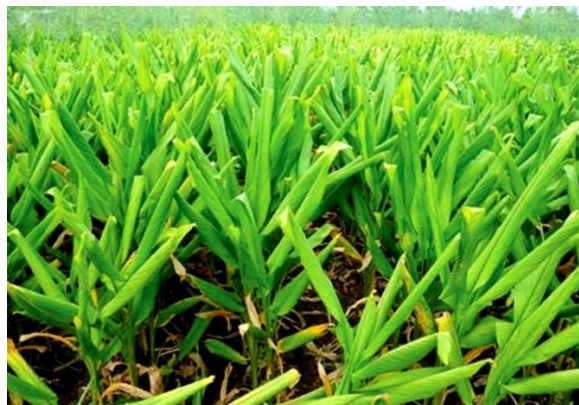
Figure 2. Turmeric plants- a cosmetic and medicinal herb

Turmeric plants and their rhizomes are presented in Figures 2 and 3 .