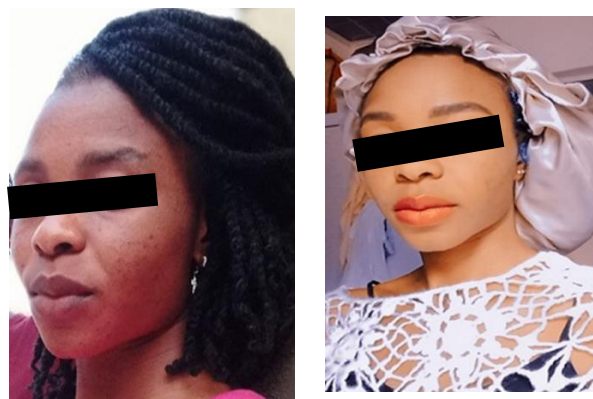
Figure 5. Before and after the Turmeric & Beetroot powder mixture

The picture of the before and after application of the turmeric and beetroot powder mixture is shown in Figure 5 .