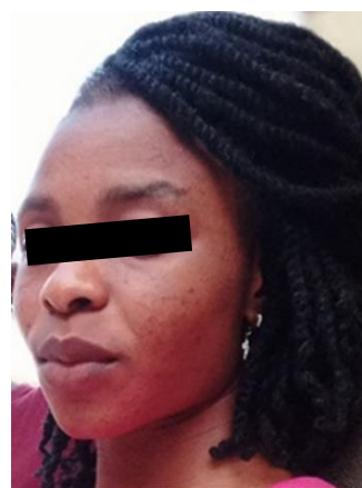
Figure 6. Before Cream Application

The pictures before the application of Obeturmeric cream ( Figure 6 ), pictures within the 7 days of Obeturmeric cream application, and pictures after the cream application are presented in Figure 7 .